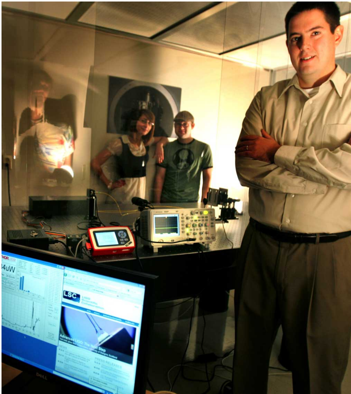
Cal State Fullerton